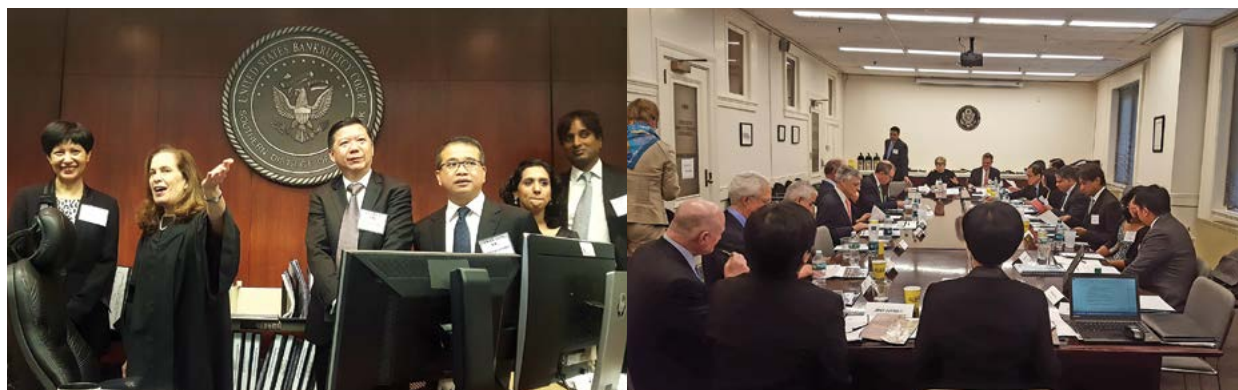
May 2017 study visit to the US Bankruptcy Court for the Southern District of New York which included discussions with judges and leading members of the New York bankruptcy bar.