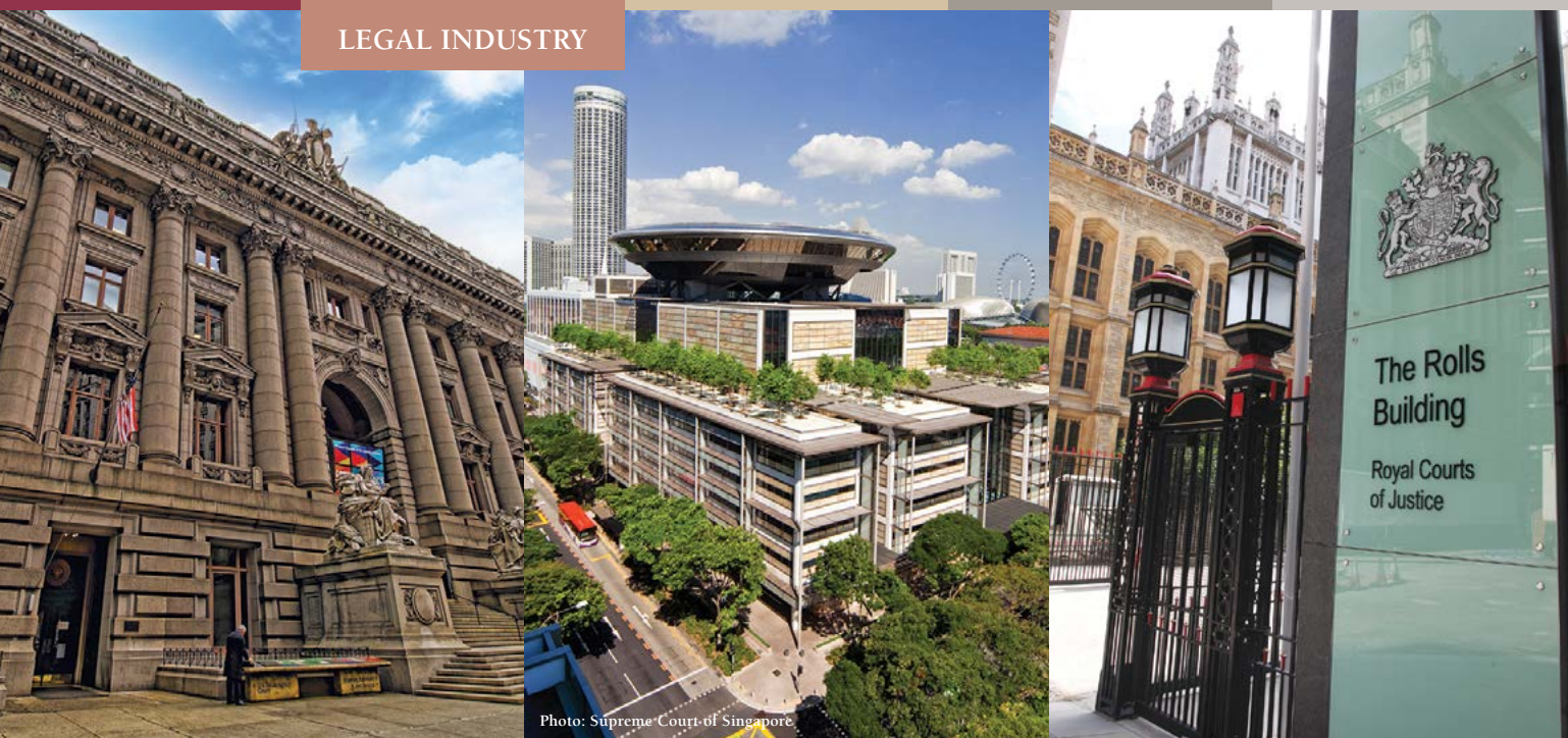
From left, United States Bankruptcy Court for the Southern District of New York, Supreme Court of Singapore, The High Court of England and Wales at the Rolls Building.