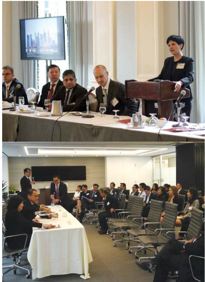
Roundtable organised by Milbank, Tweed, Hadley & McCloy LLP and GIC event on Singapore’s enhanced debt restructuring regime.

This is not to say that there are no challenges in enforcing Singapore orders, particularly in jurisdictions whose legal regimes are less developed. However, these challenges are no different from those encountered by orders emanating from other courts dealing with cross-border matters, including those of the US and UK.