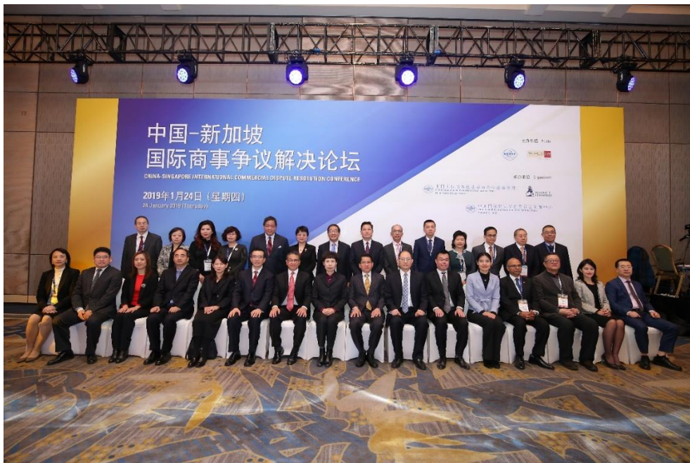
Inaugural China-Singapore International Commercial Dispute Resolution Conference in Beijing in January 2019

We actively market and promote our legal and dispute resolution services overseas, to seek out opportunities for our institutions and law firms to engage potential users; we push for access for our law firms and lawyers in key markets; and we strengthen legal cooperation at government-to-government, institution-to-institution, and people-to-people level.