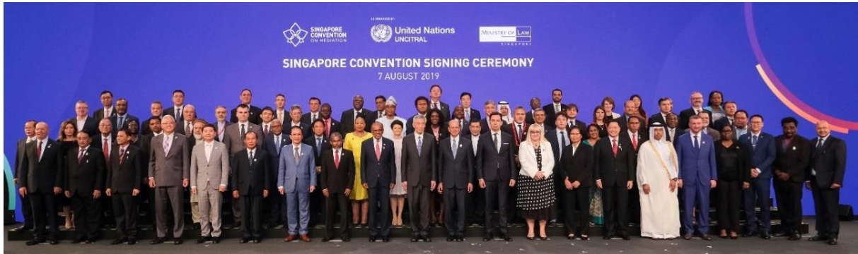
Group photo of the 70 countries who attended the Singapore Convention Signing Ceremony and Conference on 7 August 2019

I cannot look back on 2019 without mentioning the Singapore Convention on Mediation. It was a historic occasion, not just for MinLaw, but for Singapore. It was the first time that a United Nations (UN) Convention was named after Singapore – a special honour.