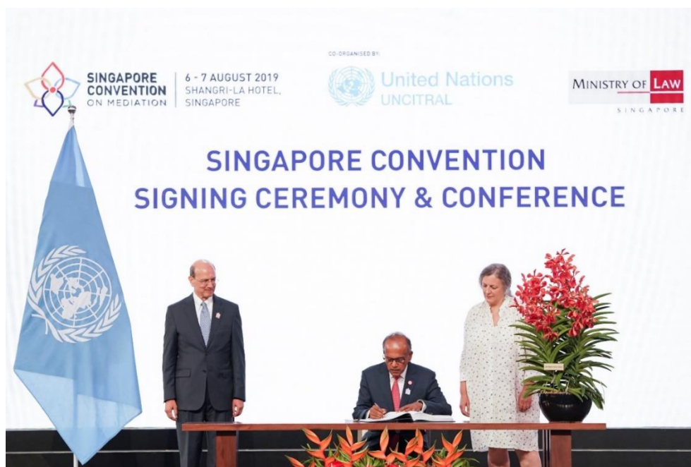
Minister Shanmugam signing the Singapore Convention on Mediation on behalf of Singapore

On 7 August 2019, when the Convention was opened for signature, 46 countries signed and another 24 countries attended to show support. Signatories included the two largest economies in the world – the US and China; three of the four largest economies in Asia – China, India and South Korea; and five of the ten ASEAN members – Brunei, Laos, Malaysia, Philippines and Singapore. Since then, six other countries signed the Singapore Convention, bringing the number of signatories to 52.