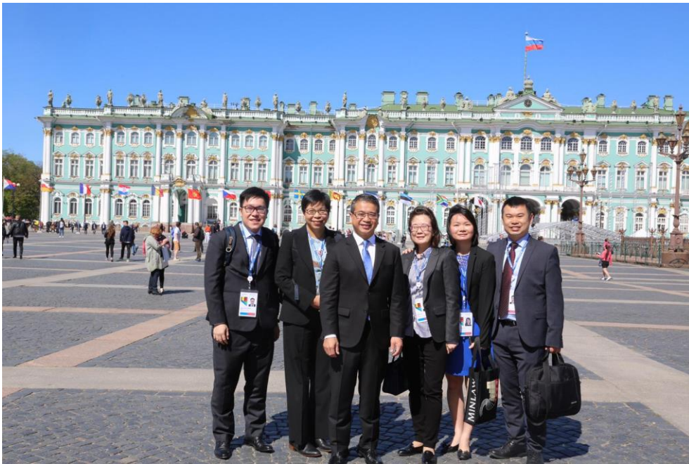
With the Singapore delegation after speaking at the St Petersburg International Legal Forum (SPILF) in May 2019

markets, and create opportunities for the Singapore law brand, our dispute resolution institutions, law firms and lawyers.