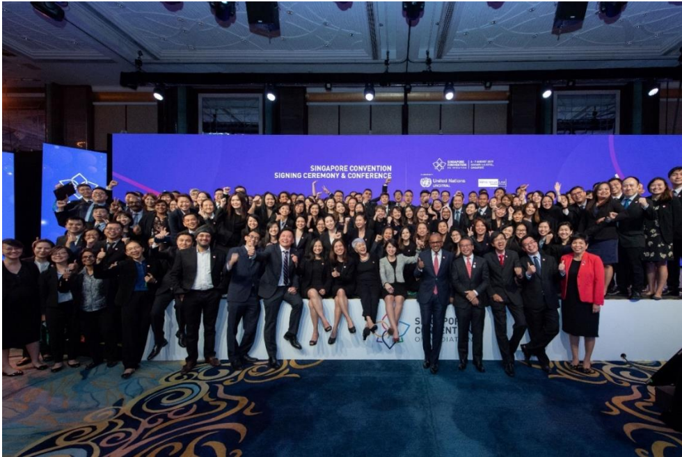
MinLaw team who made the Singapore Convention on Mediation possible!

During the Singapore Convention Week, we also saw the grand opening of Maxwell Chambers Suites; the official launch of INSOL Asia Hub; and the official launch of American Arbitration Association International Centre for Dispute Resolution (AAA-ICDR) Asia Headquarters and Case Management Centre in Singapore.