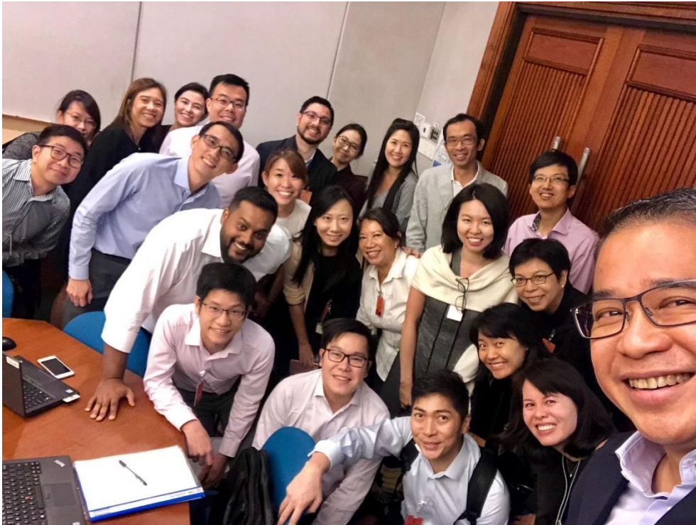
Wefie with MinLaw officers at COS 2019

By Edwin Tong, SC, Senior Minister of State for Law and Health