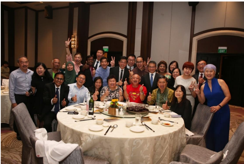
With a group of fun-loving mediators at the annual Mediators' Appointment Ceremony and Appreciation Dinner (MACAD) organised by the Community Mediation Centre